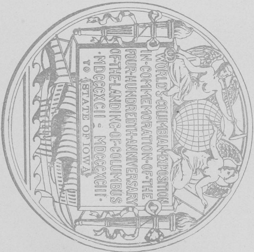
MEDALS WON BY THE STATE OF IOWA AT COLUMBIAN EXPOSITION, 1893.