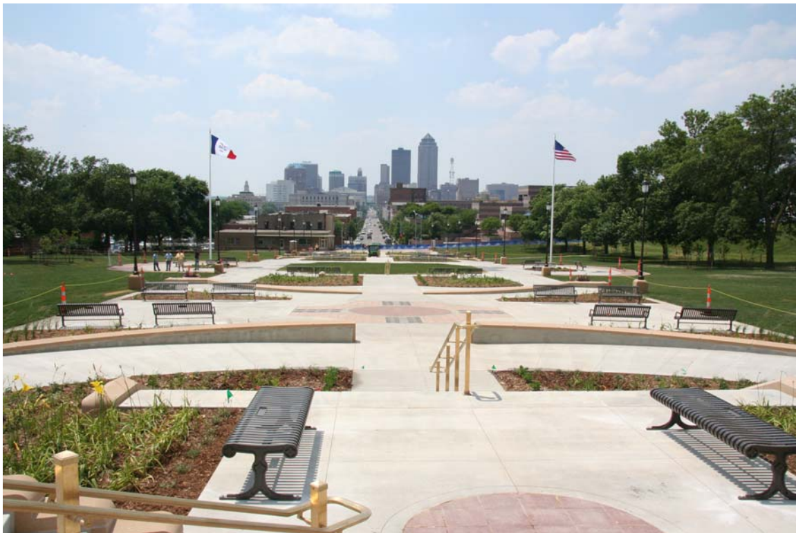
Preparations underway at West Capitol Terrace for the 2007 Hy-Vee Triathlon