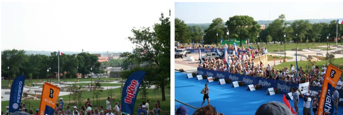
Race Day at West Capitol Terrace