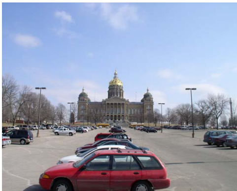
West Capitol Terrace—Before ...

The Commission has also recommended the development of a significant fountain feature—possibly costing up to $1 million—as the centerpiece for this new park. The Commission has formed a task force to provide further recommendations on the design of this major feature and to offer recommendations on possible public-private partnerships for its funding.