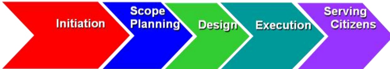
Figure 1. FY09 IOWAccess Project Lifecycle

Phase 1 - Initiation - This requires the investment of a small amount of resources, resulting in a reliable estimate of the cost of gathering and documenting detailed requirements. The initiation phase can be completed at no cost to either the IOWAccess revolving fund or the customer (in this case the state agency or branch of government), other than the time needed to complete the deliverables. Consequently, no IOWAccess funding is used for the initiation phase . The deliverables from this phase include a concept paper generally describing the e-Government process or application and a cost estimate for completion of the planning phase.