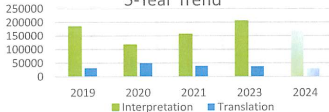
Interpretation & Translation 5-Year Trend