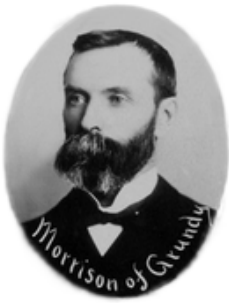
James Douglas Morrison (R)