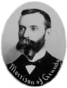
James Douglas Morrison (R)