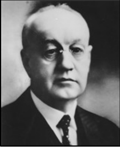
Governor Clyde Herring

Governor Clyde Herring's comments from his Biennial Address before leaving office appeared in the Senate Journal on January 13, 1937: