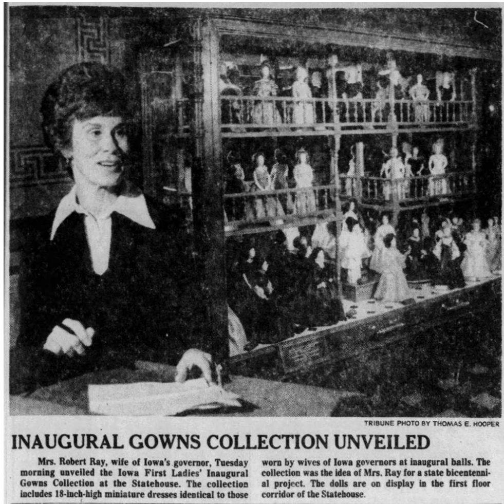
Des Moines Register, December 28, 1976