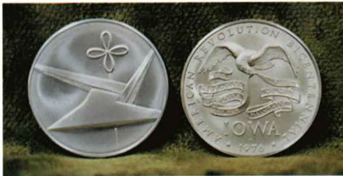
The design for this medallion was chosen via a statewide contest. The winning design showed a modernistic plow, symbolizing the state's agriculture, and the clover-leaf emblem used by the State of Iowa in its "Iowa - A Place To Grow" campaign.

Funds used to help pay for the various activities, projects, and events during the celebration came from federal grants, state appropriated funds, and local donations. One source of funds, in particular, was the sale of Iowa bicentennial medallions.