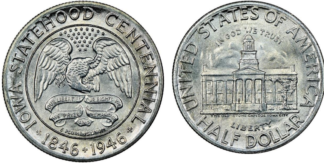
Iowa Centennial half dollar United States Mint