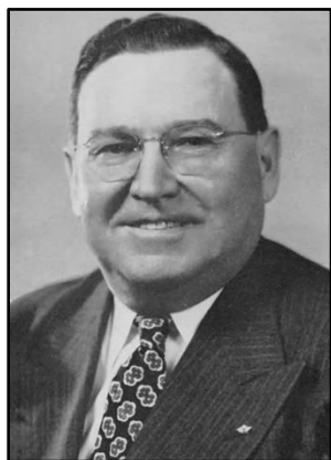
Speaker of the House Harold Felton

There were 45 Republicans and 5 Democrats in the Senate, and in the House, there were 91 Republicans and 17 Democrats. In total, 158 legislators served during the Fifty-first General Assembly.