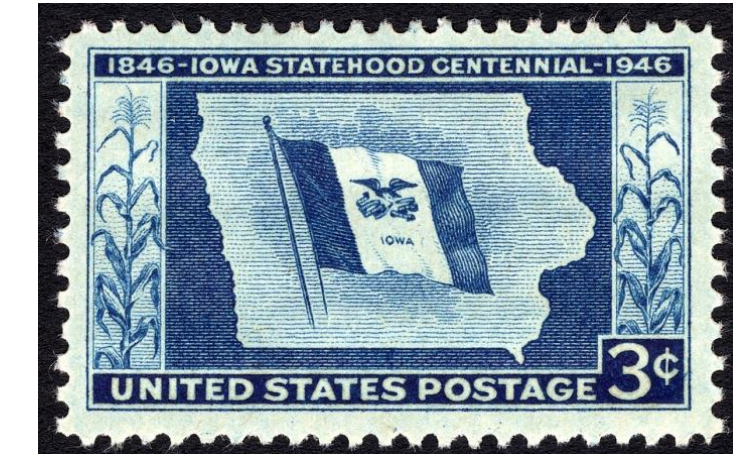
3-cent Iowa Centennial single Smithsonian, National Postal Museum