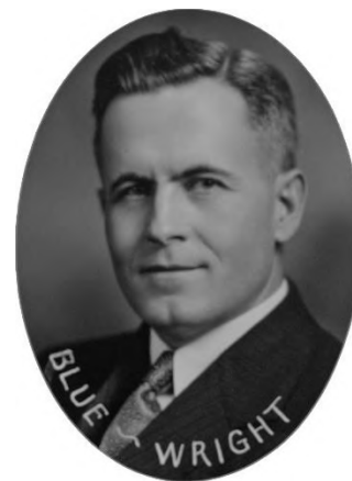
Governor Robert Blue