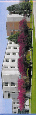
IVH campus views