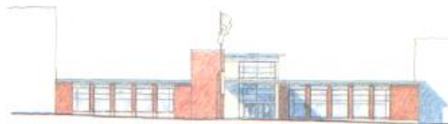
Proposed new main entry

Phase III project includes realignment of the Loftus Building's purpose from nursing units to a new main entrance and lobby area. The main entrance will be the focus of the realigned main drive which will direct visitors to the new main entrance. The lobby area will house the switchboard, visitor reception, orientation tours and historic heritage archives and museum display.