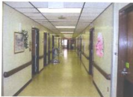
Dack Building Corridor

Permits no more than two beds per resident bedroom and states that a toilet room shall serve no more than four beds and two rooms.