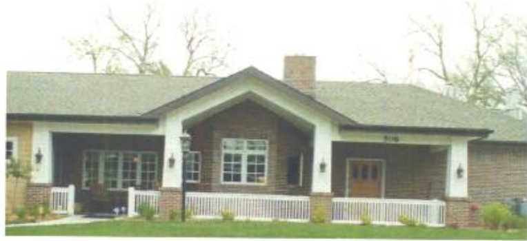
Proposed setting for 60-bed pavilion

Allow for the future demolition of Heinz Hall