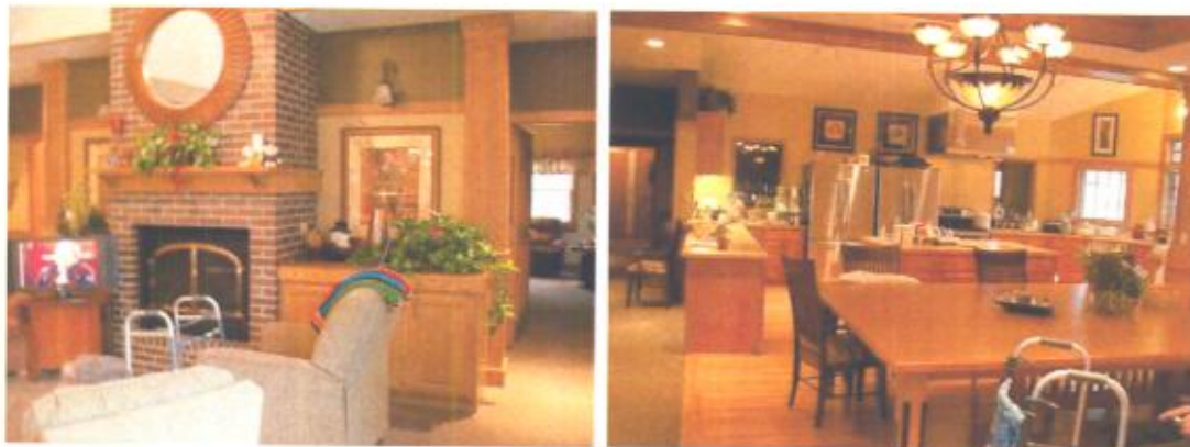
Proposed setting for new construction and remodeling