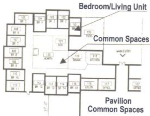
Example Freestanding Household Pavilion

The 60-bed nursing pavilion will feature four 15-bed nursing households organized around a central core support area. Each household will have its own dining and activity area with a “home-like” feel and look, intended to promote socialization. Individual bedrooms and bathrooms will be the standard for newly constructed areas.