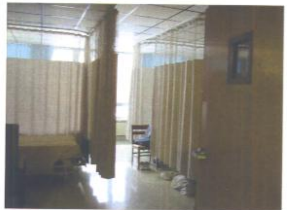
Nurses station and four-resident room in Loftus building