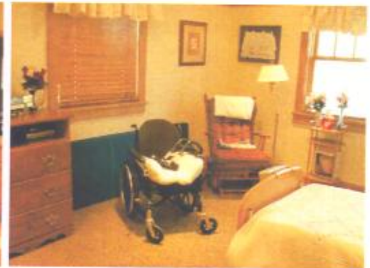
Proposed setting private bedroom