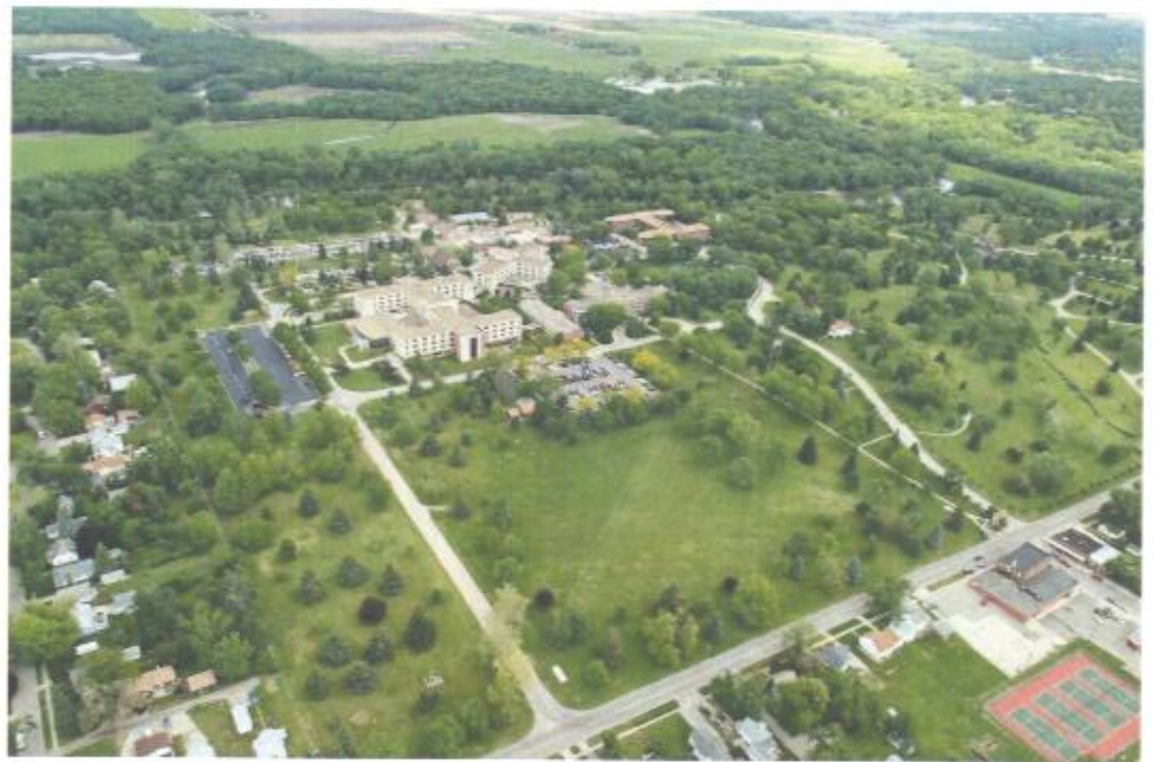
Current IVH Campus—Marshalltown, IA