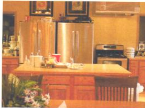
Proposed household kitchen setting to encourage resident participation

The Phase II project includes constructing a new, single story 60-bed facility featuring four 15-bed households organized around a home-like core support area. All rooms will be private for living and bathing. The core support area will feature a centralized dining and activity area with a home-like feel and look, which is intended to promote socialization.