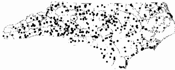
■ STATE PARKS PROJECTS, 1994-2005 ● GRANTS TO LOCAL GOVERNMENTS, 1994-2005

MISSION: To expand and improve state and local parks and to increase public beach access in North Carolina