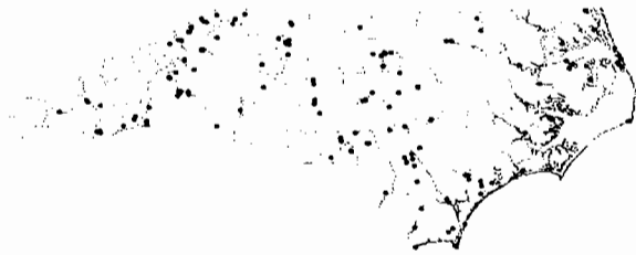
NATURAL HERITAGE PROJECTS, 1987-2005

MISSION: To acquire and protect land with outstanding natural and cultural heritage value and to inventory special natural areas in the state