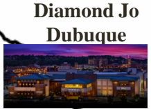
Diamond Jo Dubuque