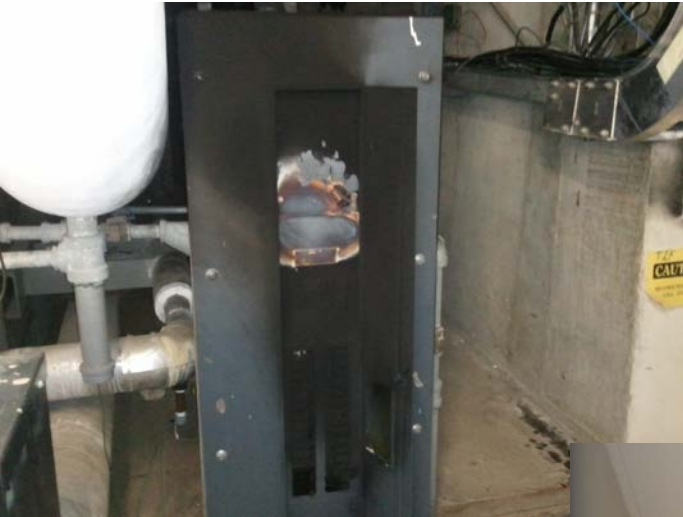
Electrical panel failure