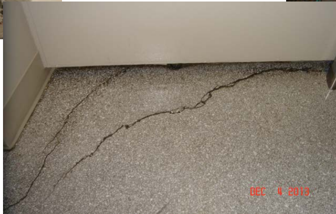
Settling causing floor cracks