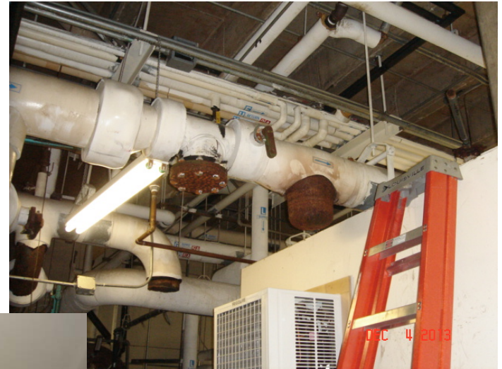
Rusty pipes at end of lifecycle