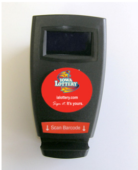
Self-checkers in many retail locations