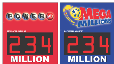
Lighted jackpot signs in retail locations