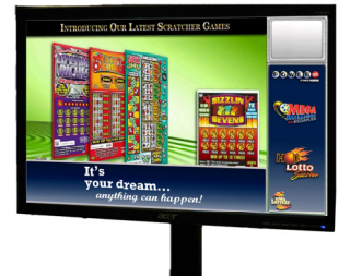
Flat-screen monitors for customer transaction details, lottery messages