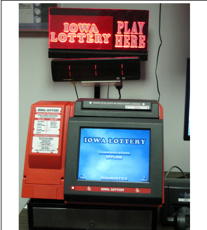
Current Iowa Lottery sales-and-validations terminal and lighted signage that has been used in retail locations since 2001