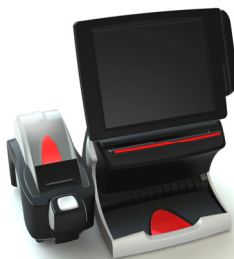
New lottery terminal & ticket printer