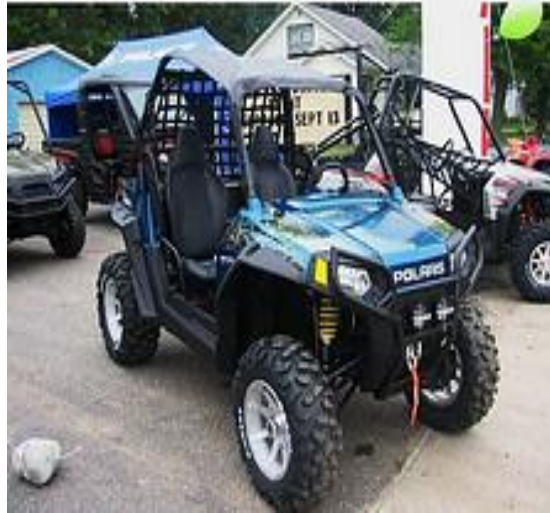
Off-Road Utility Vehicle (ORV)