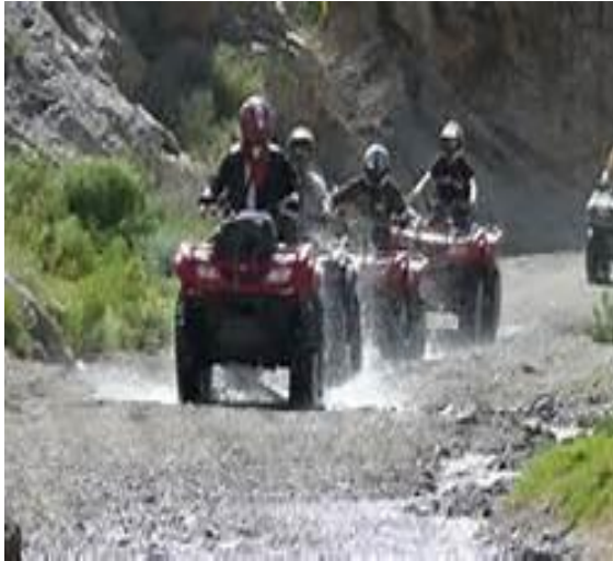
All-Terrain Vehicle (ATV)