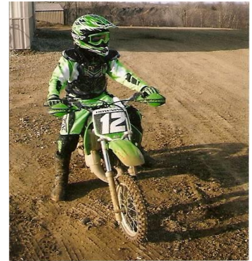
Off-Road Motorcycle (ORM)