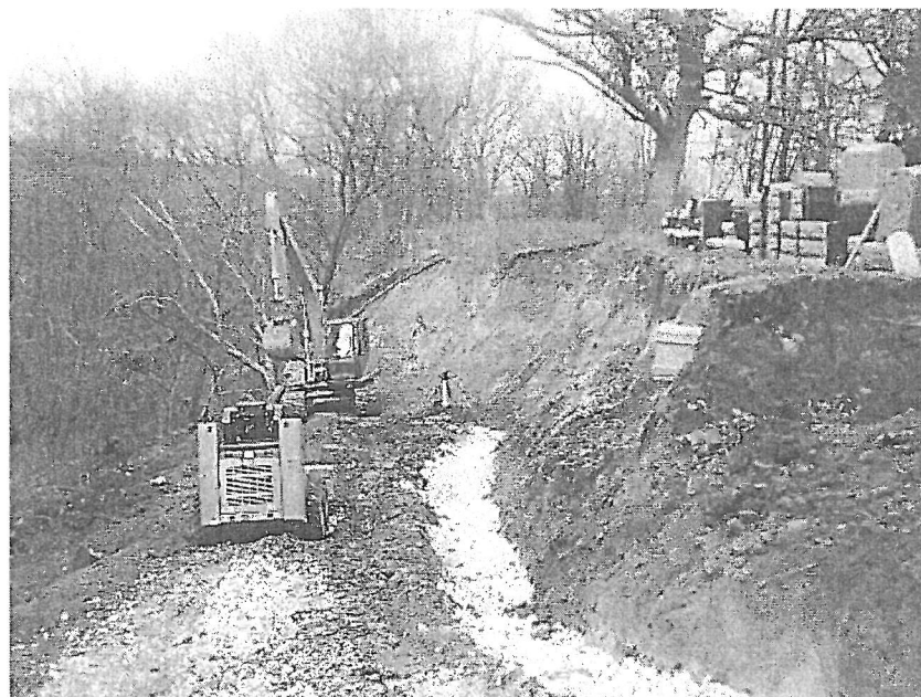
Dec. 2011: Work to build a retaining wall at Oak Grove Cemetery in Lehigh.