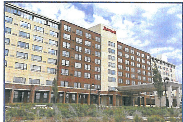
Iowa River Landing before and after redevelopment.

In the Iowa River Landing, clean-up has included: