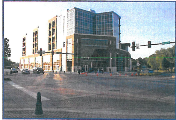
12 th Avenue north from the 5 th Street intersection in 1994 and in 2011.