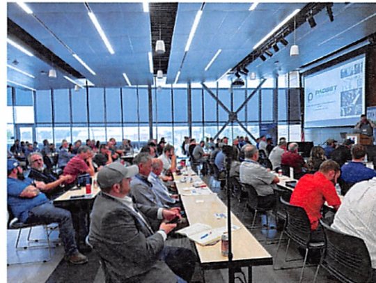
Cobot Automation Summits with the Iowa Association of Business & Industry