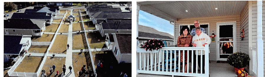
Bear River Cottages Pocket Neighborhood

By acquiring problem properties and preparing them for redevelopment by new owners in a manner most supportive of local needs and priorities, a Land Redevelopment Trust serves as a catalyst for transforming distressed properties into community assets.