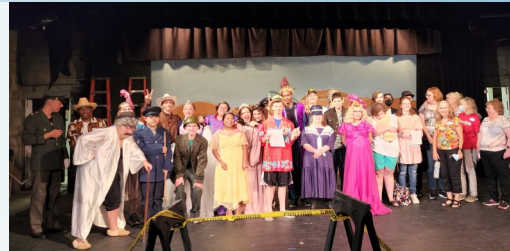
Burlington Area Office students visited the Players Workshop Little Theatre as part of their summer programming.