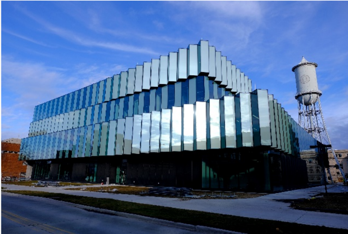
Student Innovation Center

#11 in the Nation for Undergraduate Entrepreneurship (out of 300 public and private universities)