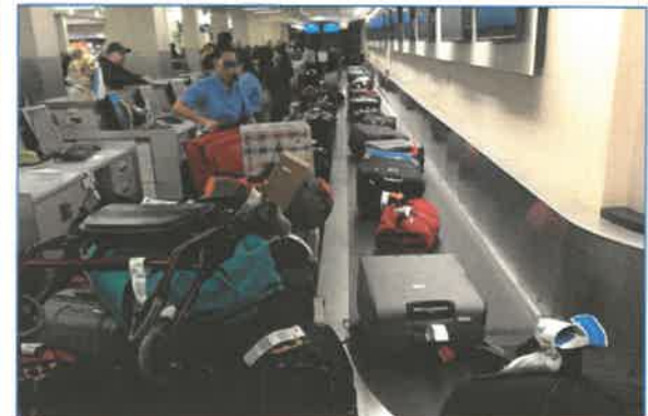
Des Moines Airport Authority