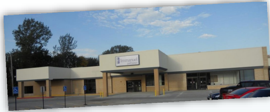
Immanuel Pathways - Southwest Iowa