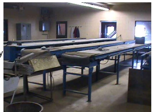
Sorting room at State Forest Nursery

The DNR requested a price increase for trees and shrubs at the May 15, 2002, meeting of the Administrative Rules Review Committee. The Committee requested the DNR meet with private nursery owners to evaluate the demand, capacity, and pricing of nursery stock in Iowa. The DNR met with various forestry stakeholders and prepared a summary report for the Committee dated June 11, 2002.