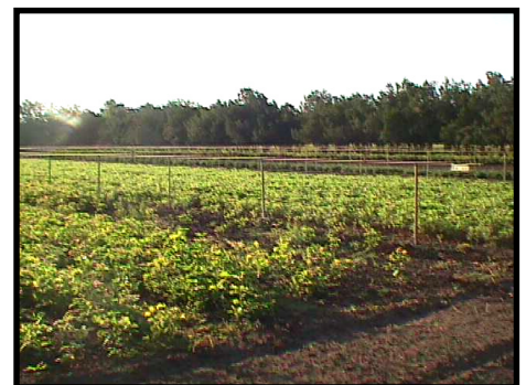
State Forest Nursery in Ames, Iowa