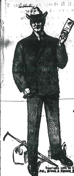
Double Breasted Sack