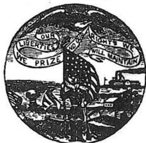
SEAL OF THE STATE OF IOWA

THE CENTURY HISTORY COMPANY 41 LAFAYETTE PLACE NEW YORK CITY