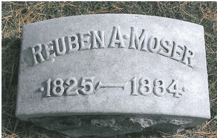
Image is scaled. Click image to open at full size. Added by: Julia Johnson 8/05/2011