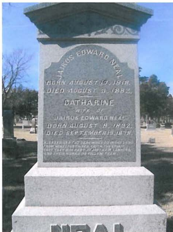
Added by: Barb 2/20/2008