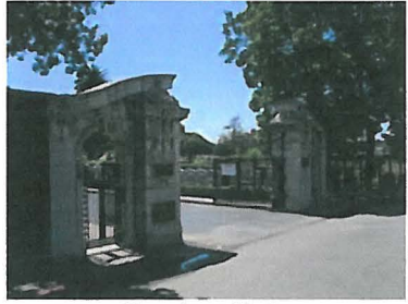
Cemetery Photo Added by: A.J. Marik