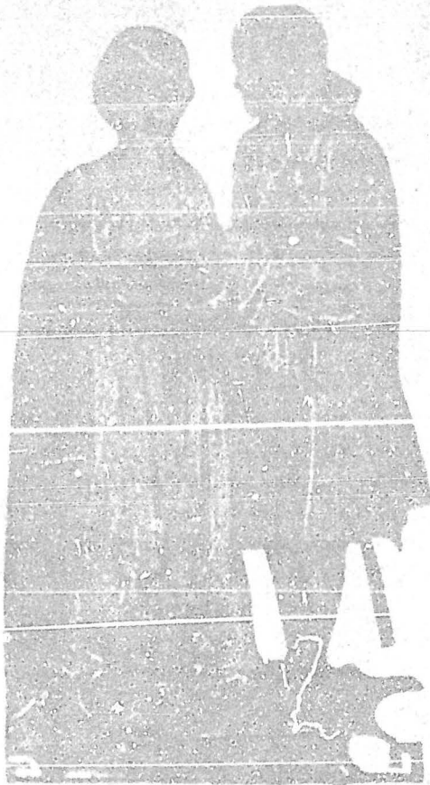
ALICE TERRY and LEWIS STONE in "SCARAMOUCHE"

"Scaramouche," a Rex Ingram production for Metro Pictures Corporation, adapted from Rafael Sabatini's novel of the same name, will come to the Peoples Theatre for three days on Friday, Saturday and Sunday—June 13, 14 and 15th. This picture a feature in ten reels, has been played as special attractions in the big cities and comes to Redfield acclaimed by critics as one of the masterpieces of filmdom.