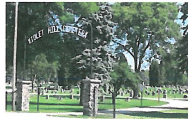
Cemetery Photo Added by: ZBonnie