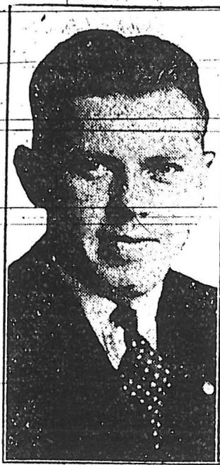
MARVIN CHESTER PARK.