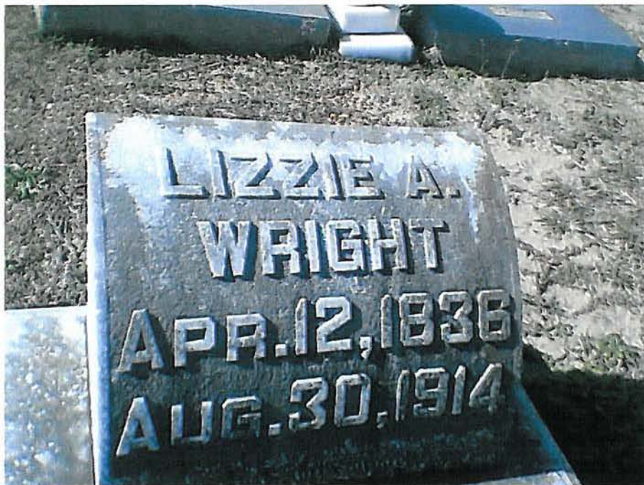
Image is scaled. Click image to open at full size. Added by: Dorothy J. Thompson 2/03/2009