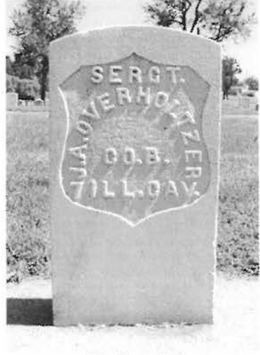
Added by: svh77

Imported from: US Veteran's Affairs Record added: Mar 04, 2000 Find A Grave Memorial# 3740909