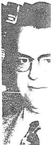
T. C. S. For Co.