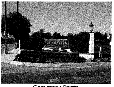
Cemetery Photo Added by: Grover1962