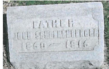
Added by: FLH

Created by: FLH Record added: Dec 10, 2005 Find A Grave Memorial# 12651800