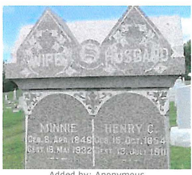
Added by: Anonymous

Grant Township (rural Schleswig) Ida County Iowa, USA