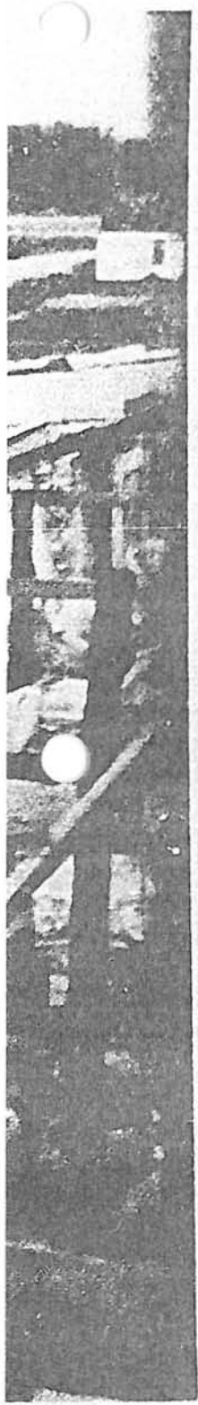
... hall following ... lumber ... The ... picture ...

... Saturday night he was a bit more weary than usual. When he heard the news that a fierce windstorm had brought some local damage he recalled instantly that it was just 17 years ago on the last day of April, 1936, that a tornado roared through the community.