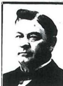
Added by: Marc Thayer, III 10/10/2009