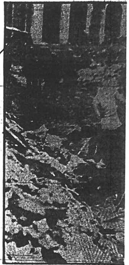
Germany—German prison for infractions of Allied milit- ing up a street in Kitzingen. men of the 394th Infantry Re