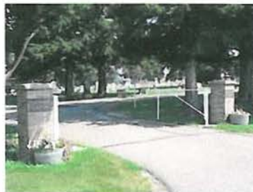
Cemetery Photo Added by: Ken Beckman

Created by: steamerfan Record added: Sep 21, 2008 Find A Grave Memorial# 29978640