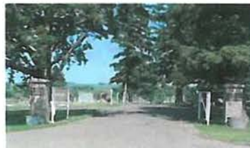
Cemetery Photo Added by: Brenda Allyn