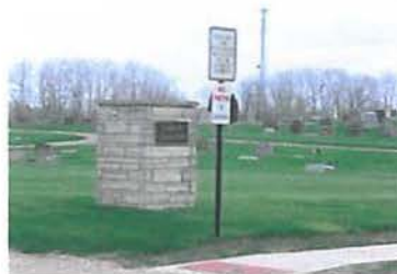
Cemetery

Record added: May 26, 2008 Find A Grave Memorial# 27090950