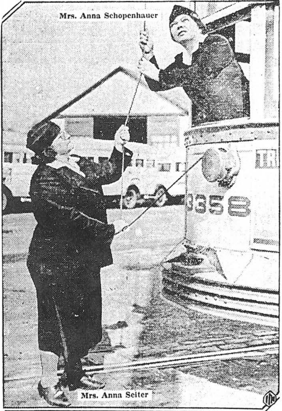
Mrs. Anna Schopenhauer