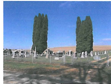
Cemetery Photo