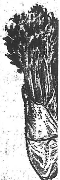
Fancy — Sp