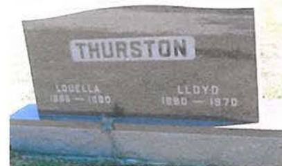
Added by: K