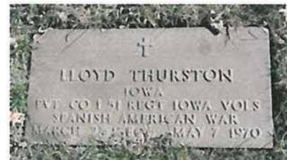
Added by: K