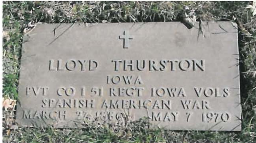
Added by: K 8/25/2006