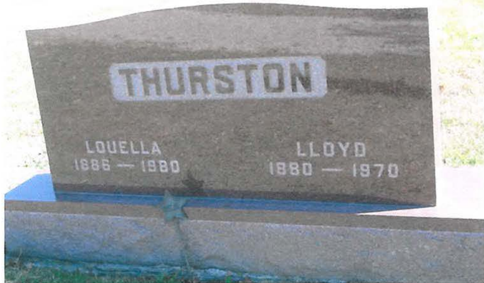
Added by: K 8/25/2006