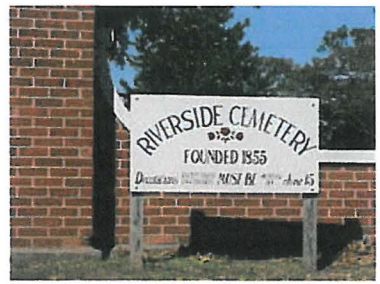
Cemetery