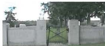
Cemetery Photo Added by: Ruth Moss