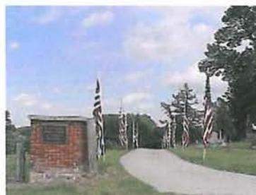
Cemetery Photo Added by: Bev

Created by: ADD Record added: Oct 01, 2010 Find A Grave Memorial# 59482353