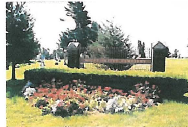
Cemetery