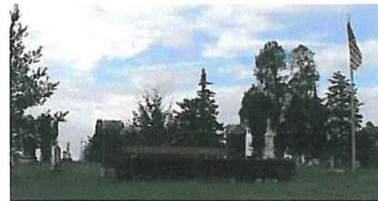
Cemetery Photo Added by: Jesse